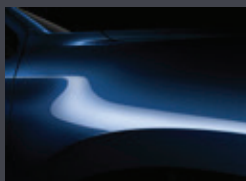
Gun Blue Metallic